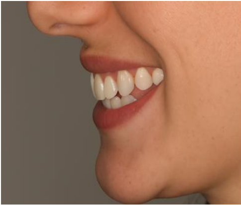
Profile High Smile