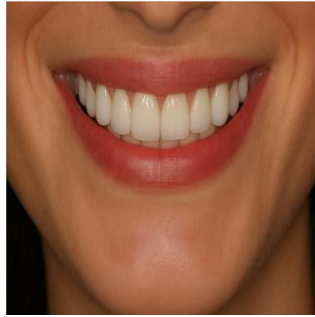
Close Up, High Smile