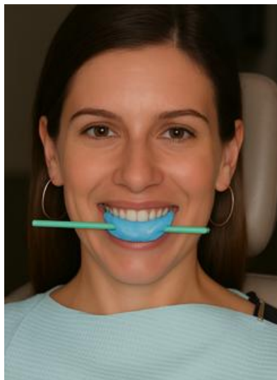
Stick Bite and/or Kois Facebow